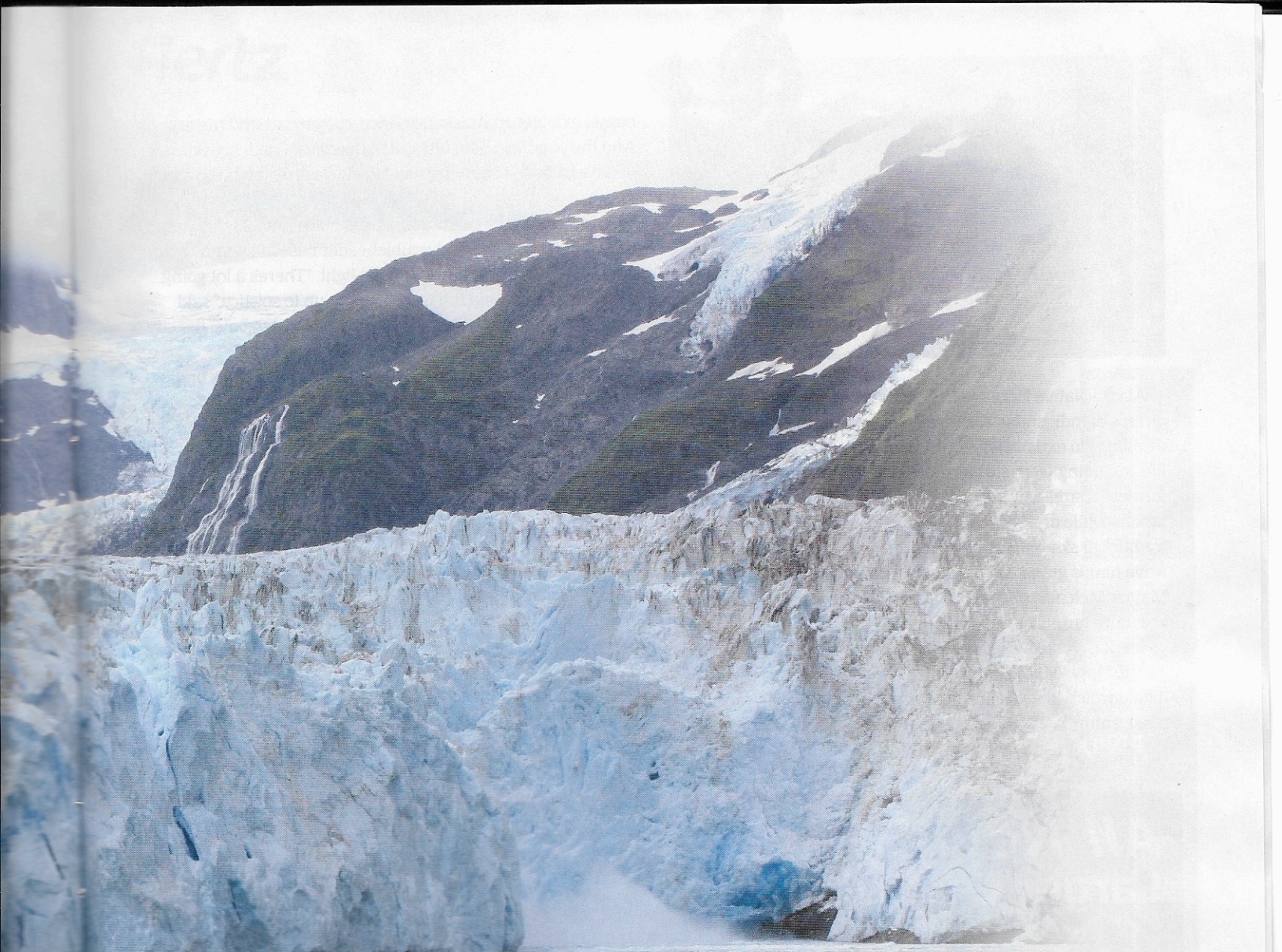
GLACIERS CALVING IN PRINCE WILLIAM SOUND

Glaciers Galore The Alaska Railroad Glacier Discovery Train took us on a two-and-a-half-hour scenic ride to Whittier, an ex-military base turned fishing village, where glacier cruises depart. Along the way, we were treated to contrasts of greenery, glimmering water and mountains dotted with Dall sheep. The train journey ended after chugging through Anton Anderson Memorial Tunnel. At two-and-a-half miles, it's North America's longest tunnel shared by trains and cars.